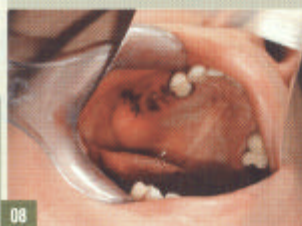
08 Situation after wound closure