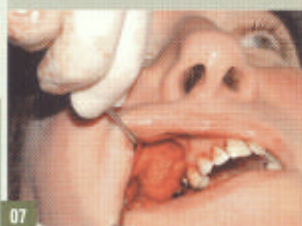
07 The finished augmented sinus cavity