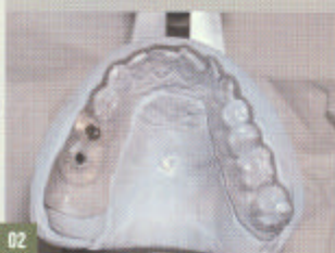
02 Drill template with titanium sleeves