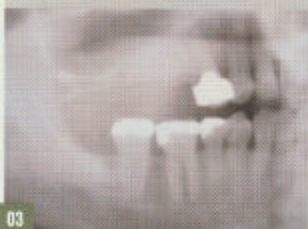
03 Initial OPG