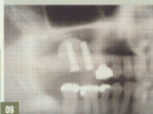
09 OPG after 4 months, early ossification