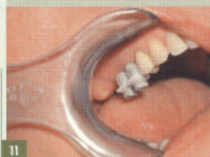
11 The ITI transfer system

The procedure was as follows: Exact transfer with impression caps and positioning cylinder was undertaken using the 5.5 mm height. [fig. 11]