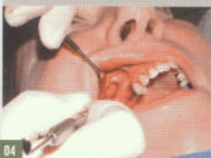
04 Local access to the sinus cavity