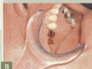
15 The reduced solid abutments