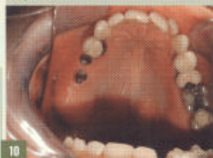
10 Trying the solid abutments