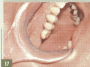
17 The finished work in the mouth