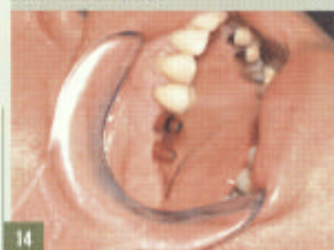
14 The coded copings in the mouth