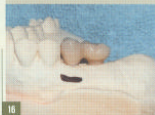
16 The finished work on the model