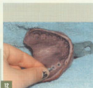
12 Inserting the analogues