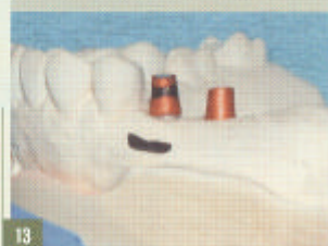
13 The copings of pattern resin, coded and shortened