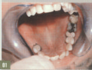
01 Shortened row of teeth in the right maxilla

The treatment of a shortened row of teeth in the right maxilla using two ITI implants